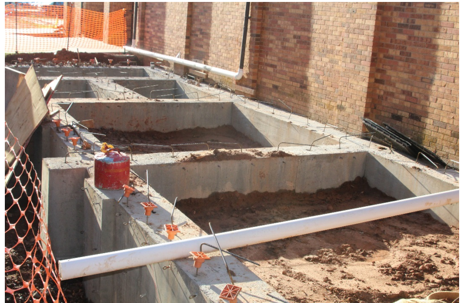
Fain Fine Arts Stairwell and Elevator