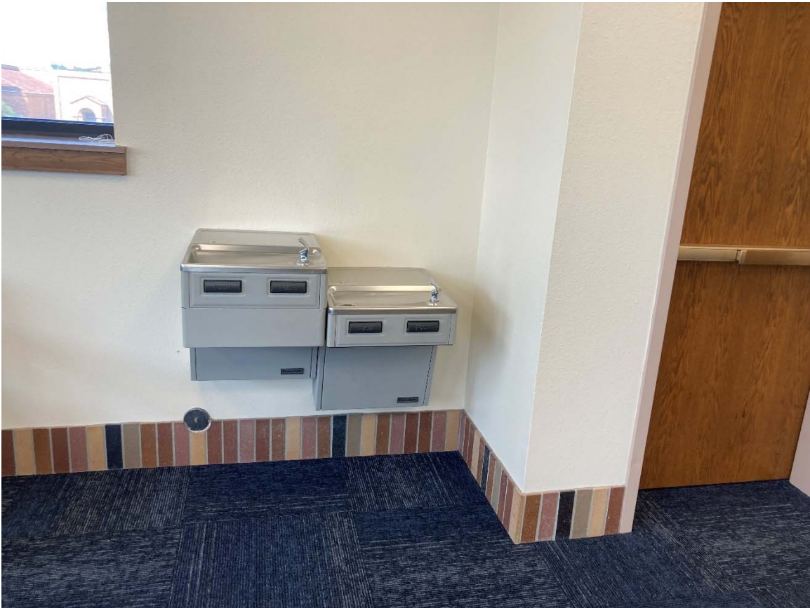
Image 22 (Prothro-Yeager-Beawood-O'Donohoe (PYBO), 2 ND Floor, South Lounge)