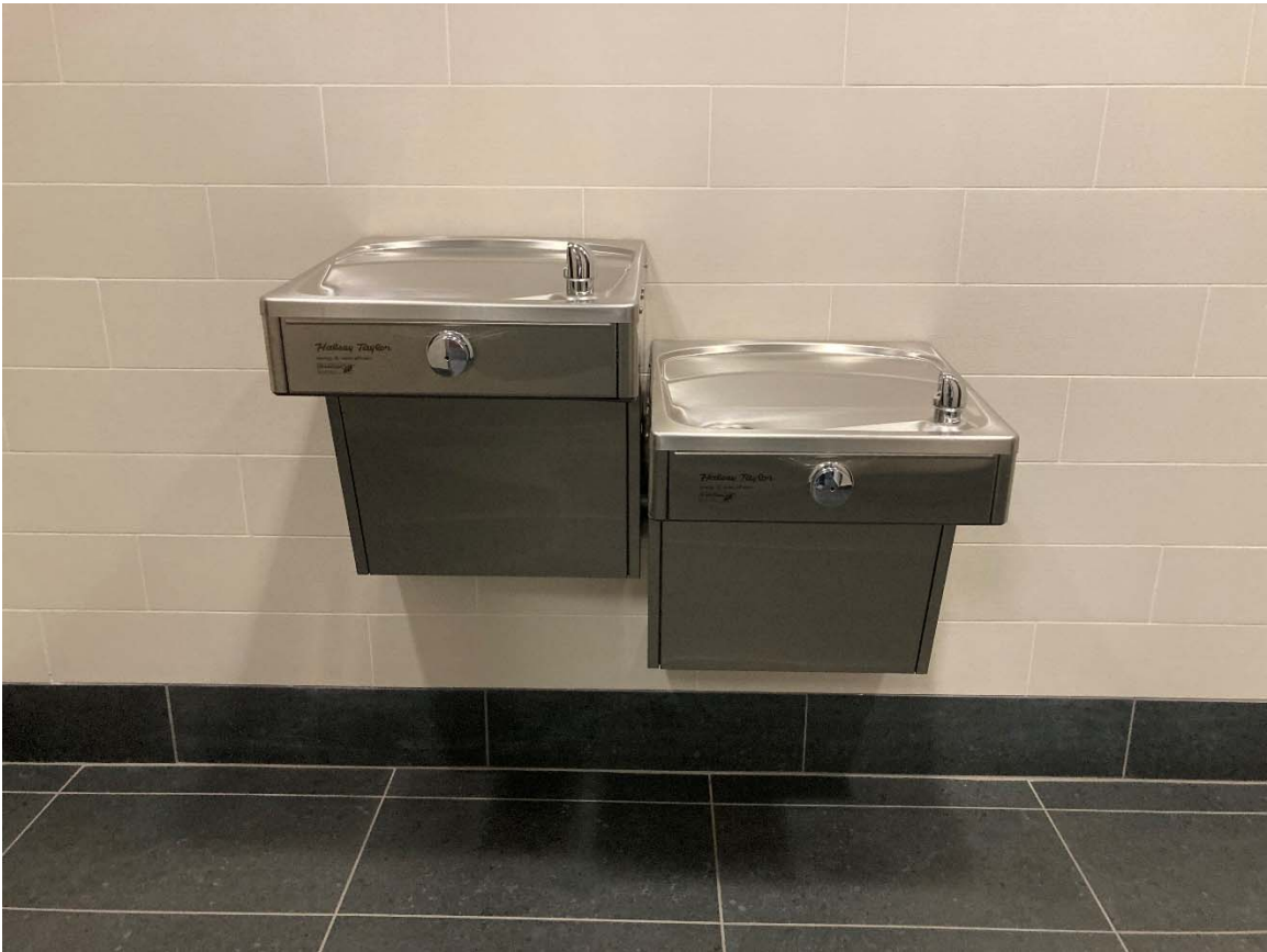
Image 16 (Mass Communications, Fain Fine Arts, D Section, 1 st Floor)