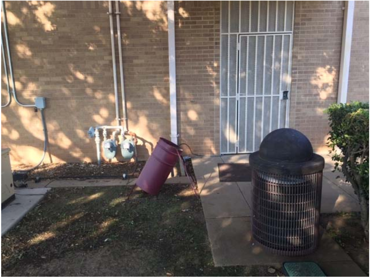
IMG_9803: Caged area on west side of UPD.