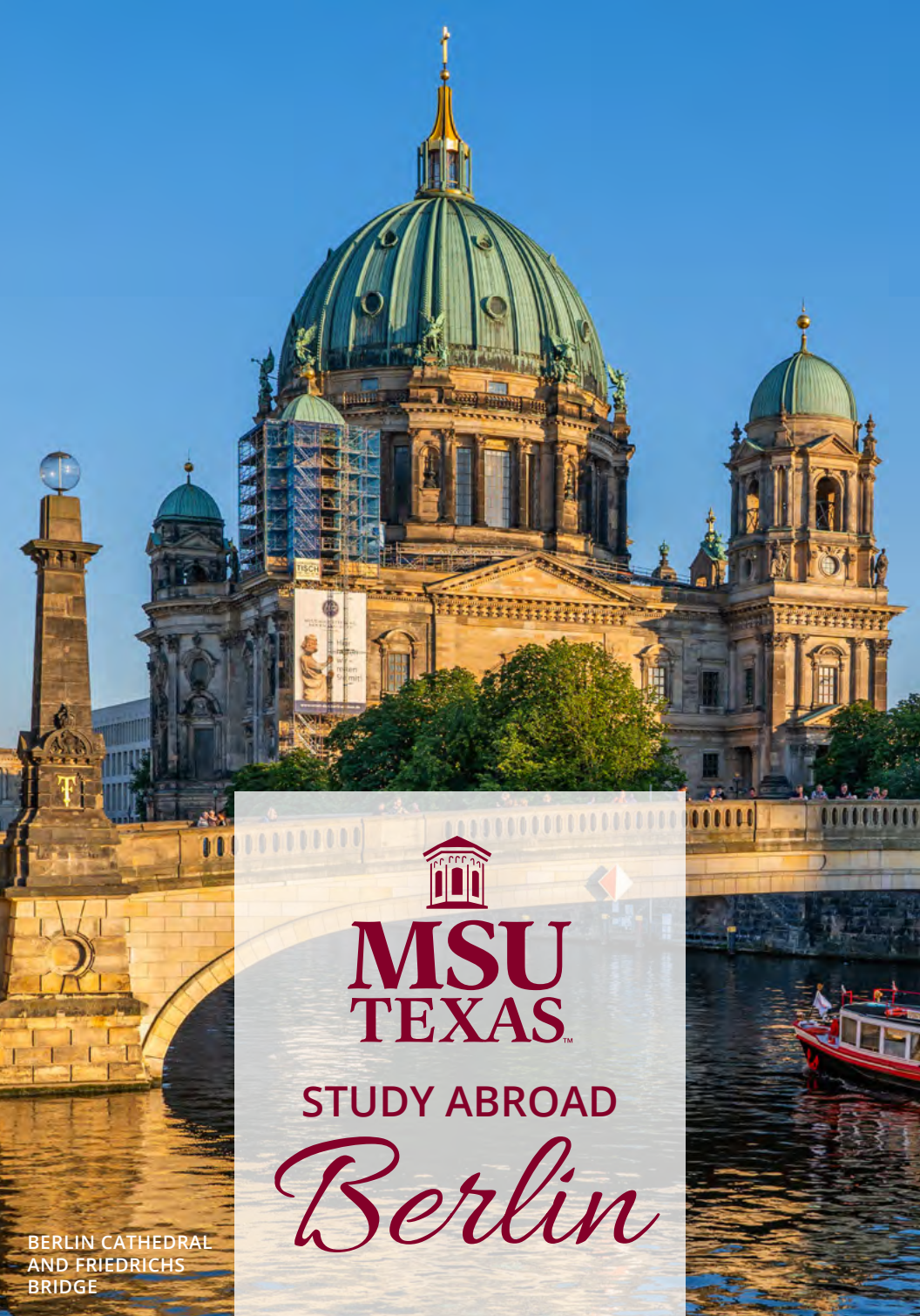
BERLIN CATHEDRAL AND FRIEDRICHS BRIDGE