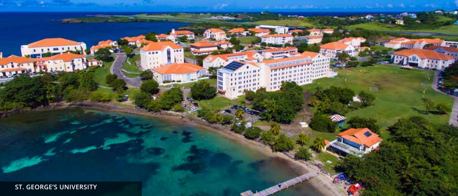
ST. GEORGE'S UNIVERSITY